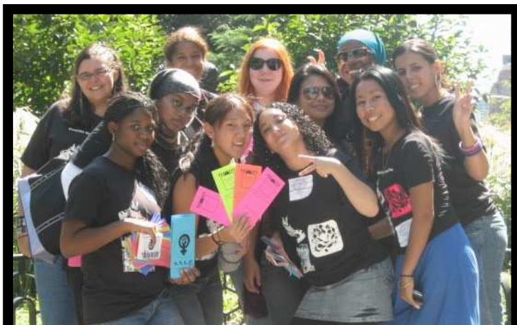
Nashers celebrate the completion of LAP's "You(th) Have the Right To" youth rights awareness campaign. A portion of this campaign involved handing out pamphlets and discussing youth rights with people in Union Square.

The Summer Institute is funded in part by Barker Welfare Foundation, Charles Hayden Foundation and the Thomas and Jeanne Elmezzzi Private Foundation and by our many other funders who provide us general support – thank you!